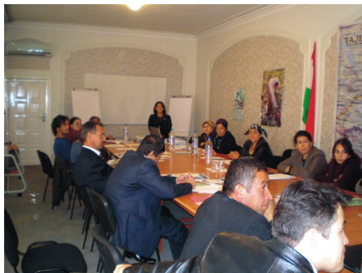
Workshop “Gender aspects in water resources management in the Republic of Tajikistan”